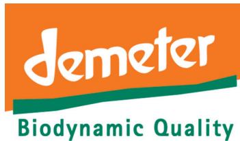
BDA Certification bdcertification.org.uk