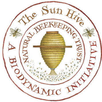
The Natural Beekeeping Trust www.naturalbeekeepingtrust.org

Biodynamic Association vital soil, vital food